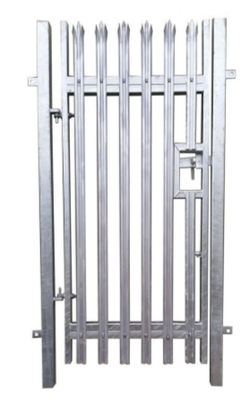
Pedestrian gates manual operated swing gates - Green RAL 6005 Width to suit access point Height - 2.4m