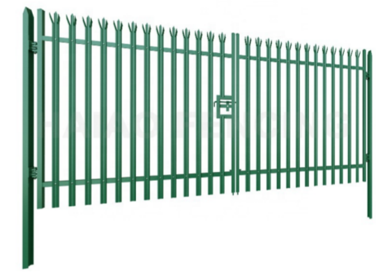
Vehicle gates manual operated swing gates - Green RAL 6005 Width - varied to suit roadway Height - 2.4m